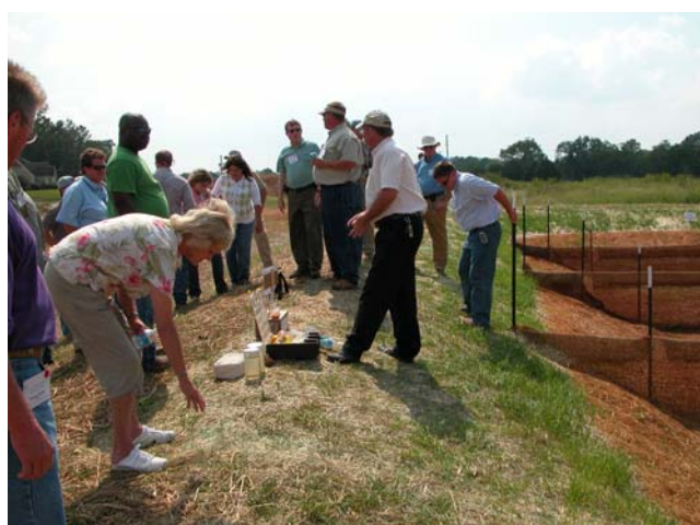
Field Days are funded in part by a Clean Water Act Section 319 grant from Environmental Protection Agency Region 4.

Jefferson County Soil & Water Conservation Foundation 6267 Park South Drive Bessemer, Alabama 35022